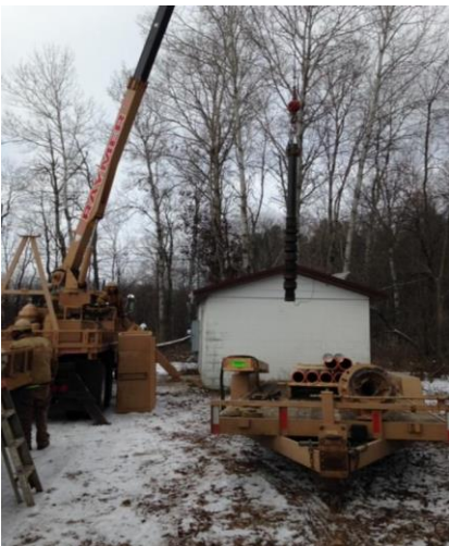
Well # 3 pulled for routine inspection.